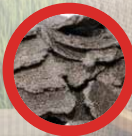
Cotton Seed Oil Cake