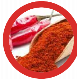
Red Chilli (dry)