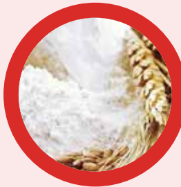
Wheat & Wheat Flour